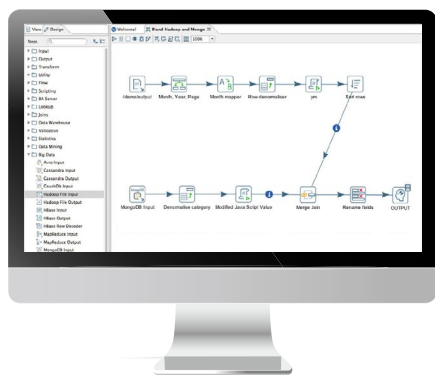
Figure 1: Drag-and-Drop Data Transformation in Pentaho Data Integration

Pentaho Data Integration's adaptive big data layer allows you to plug into popular big data stores with flexibility and insulation from change. Data can be accessed once, then processed, combined and consumed anywhere. The adaptive big data layer includes plug-ins for Hadoop distributions and object stores from Cloudera, Hortonworks, MapR (HPE Ezmeral Data Fabric), Amazon Web Services, Google Cloud and Microsoft Azure, object stores such as Hitachi Content Platform, as well as popular NoSQL databases like MongoDB and Cassandra.