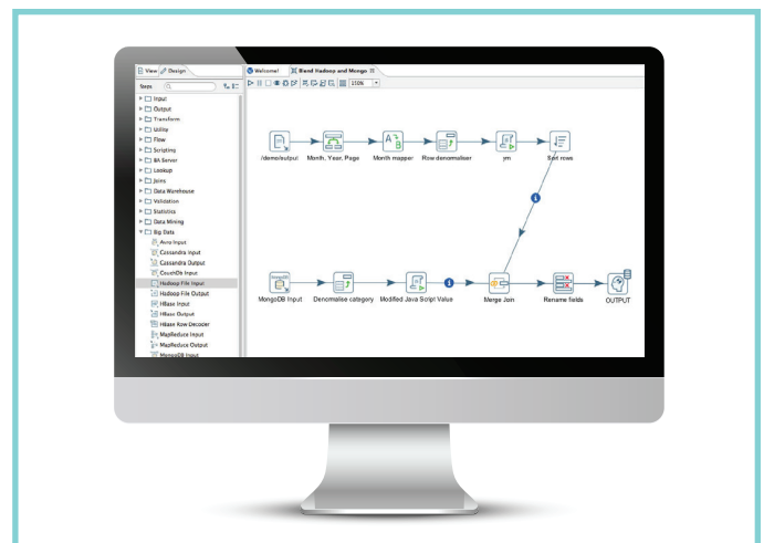
Drag and drop data transformation in Pentaho Data Integration